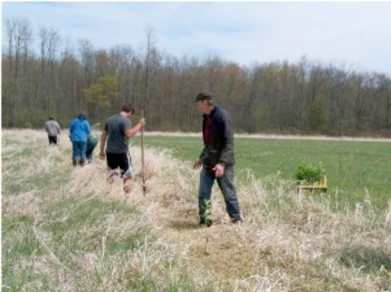
The Swamp Work Crew!