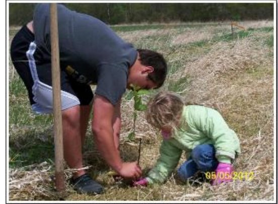
The youngest worker!