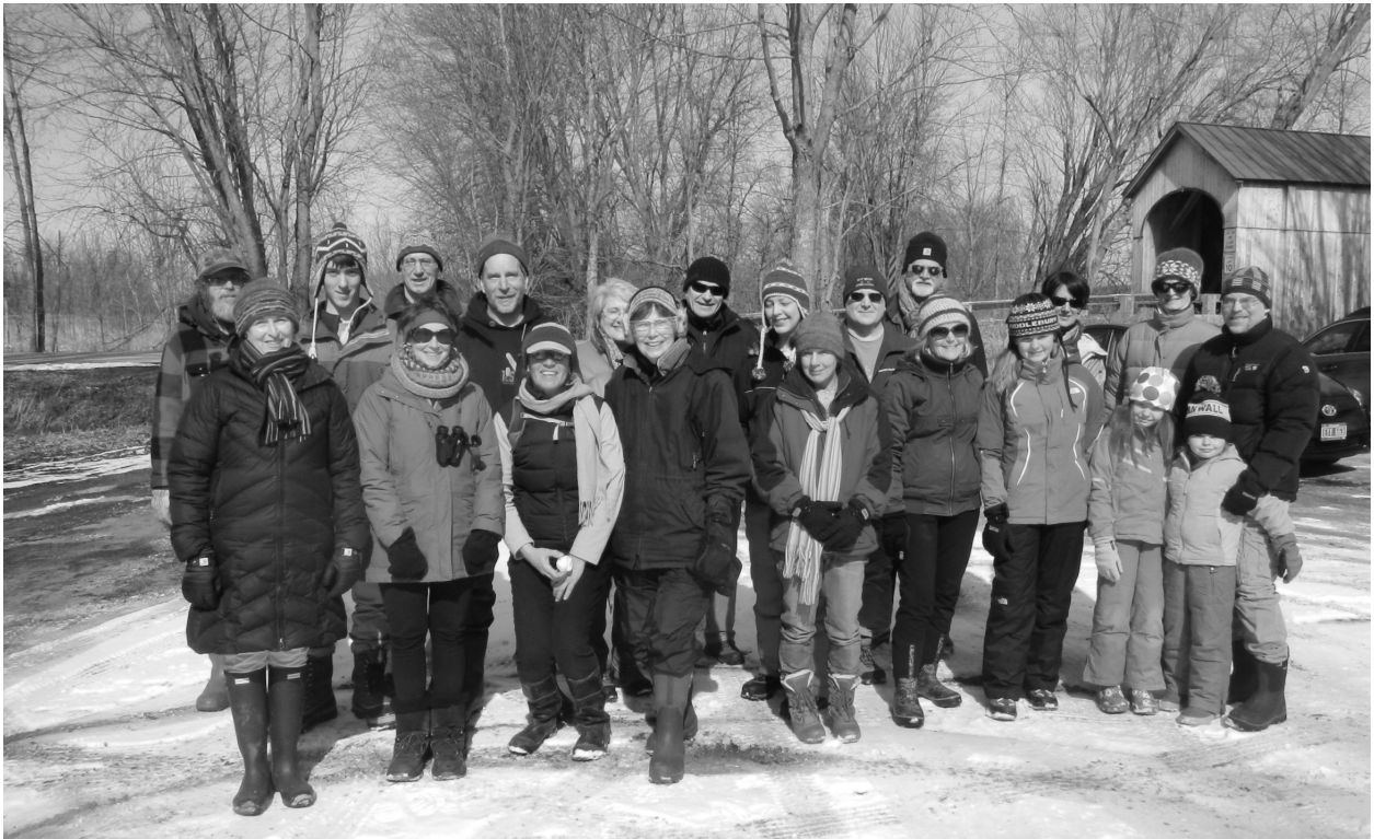
Twenty-nine folks donned tuques and rubber-soled boots to participate in the February 27 “Swamp Walk.”

We also continue to work closely with the Planning Commission and we look forward to beginning work with the DRB (Development Review Board) once they are up and running smoothly.