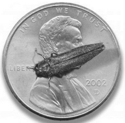
Example of the size of the Emerald Ash Borer. See picture at left for size compared to a penny.