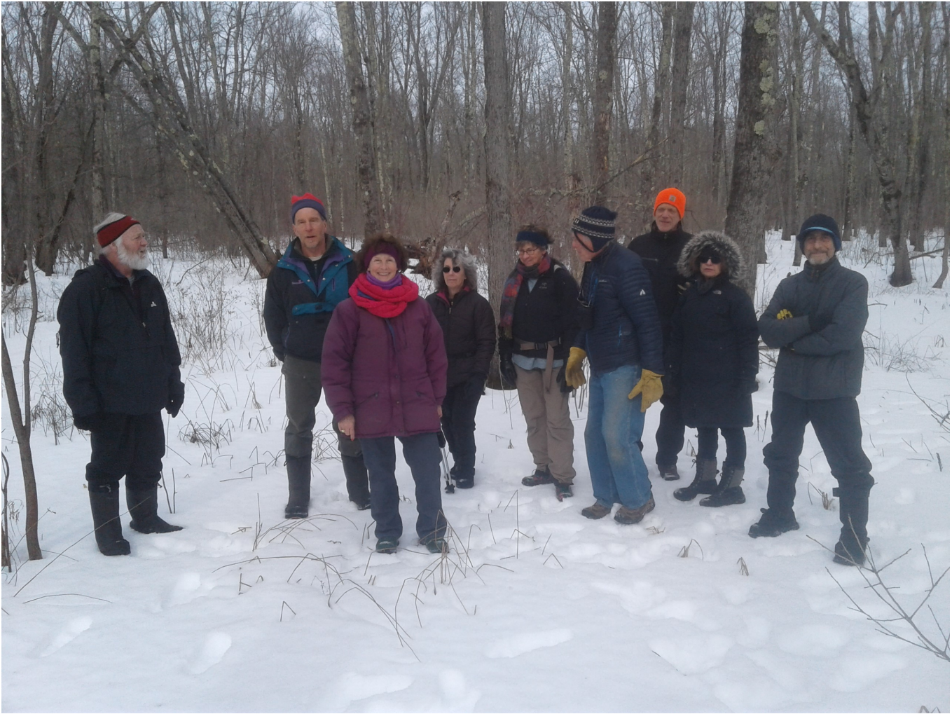
Participants in the Cornwall Conservation Commission Swamp Walk