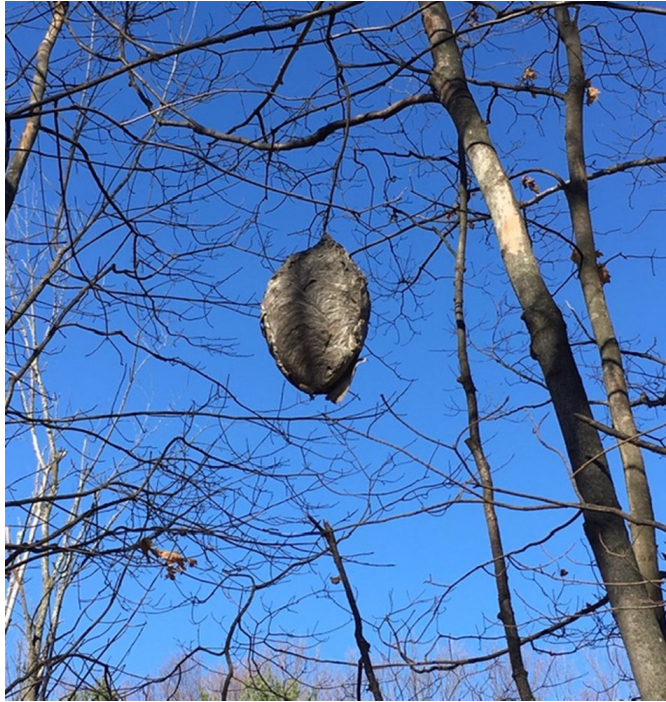
Wasp nest observed at the November 2 nature