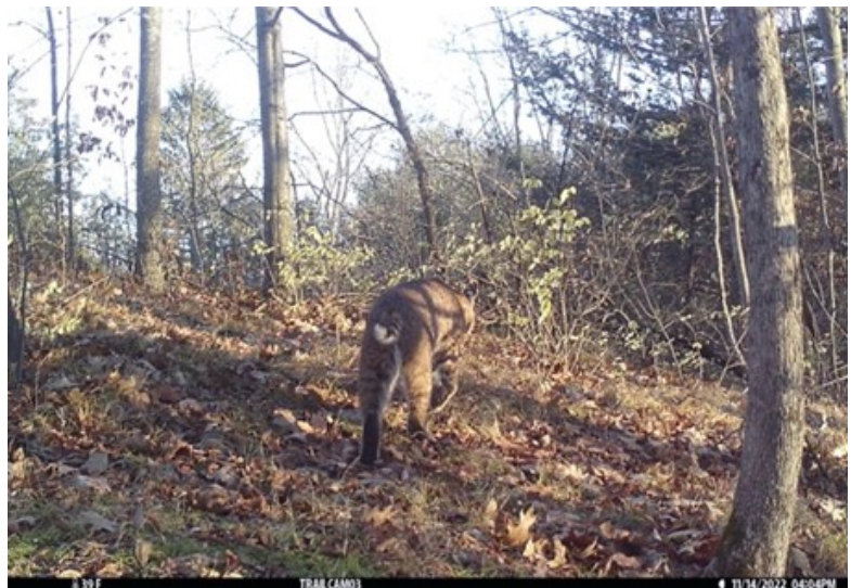
Bobcat wandering away from the camera

The old placement was less than 200 feet away, but it was nearer the home and driveway. The new placement feels remote with a wet drainage area between it and the house. Invasive honeysuckle and buckthorn predominated in the old placement, whereas the new spot has a mix of native and non-native shrubs and trees. It has a “wild” feeling, quiet and unvisited by people and their dogs.