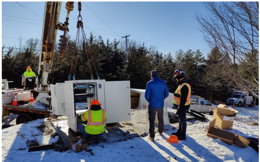
Construction crew installing the first network hub on a very chilly day!

Visit our web site, maplebroadband.net , to find out more information or sign up for our newsletter.