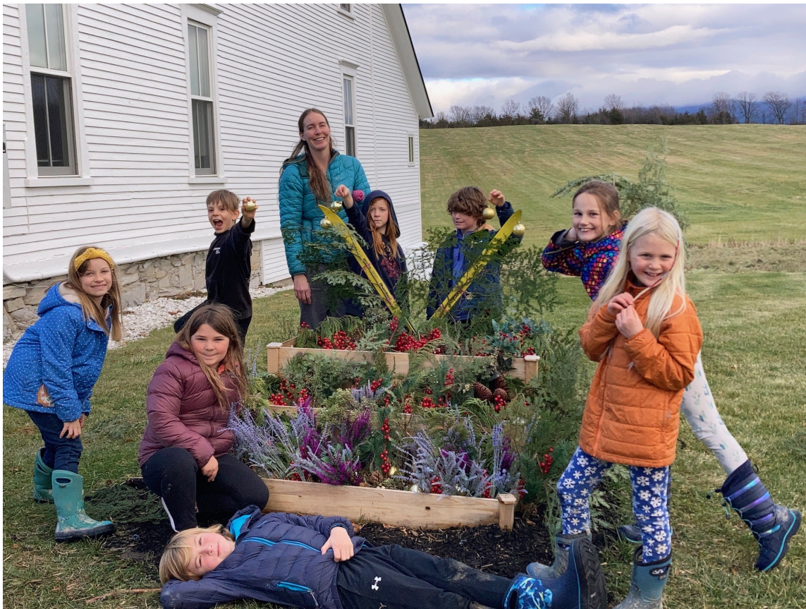
Students from Cornwall Elementary Doing Community Service!

The opinion's expressed in the newsletter are those of the citizen's writ- ing the articles, not those of the Town of Cornwall.