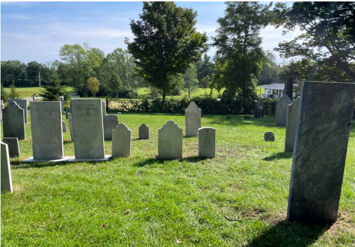
South Cemetery on Delong Road. Location where memorial markers were recently placed.

The opinion's expressed in the newsletter are those of the citizen's writ- ing the articles, not those of