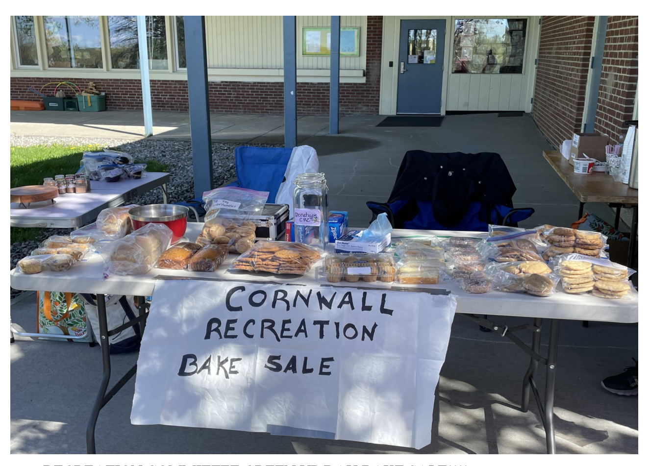
RECREATION COMMITTEE GREEN UP DAY BAKE SALE!!!!

The opinion's expressed in the newsletter are those of the citizen's writing the articles, not those of the Town of Cornwall.